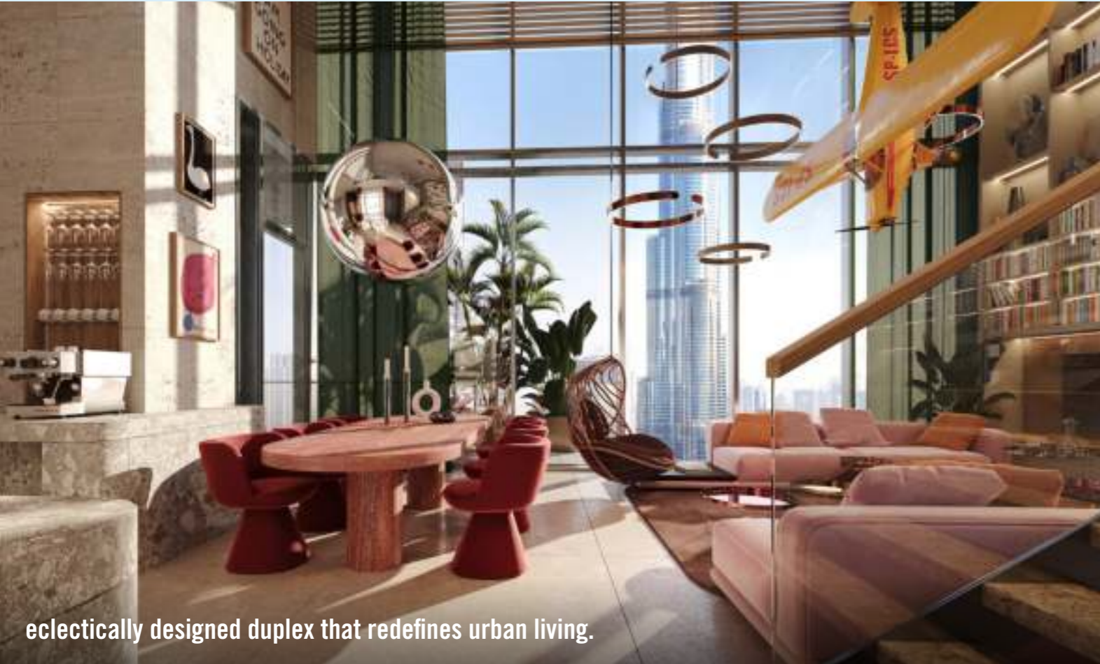
eclectically designed duplex that redefines urban living.