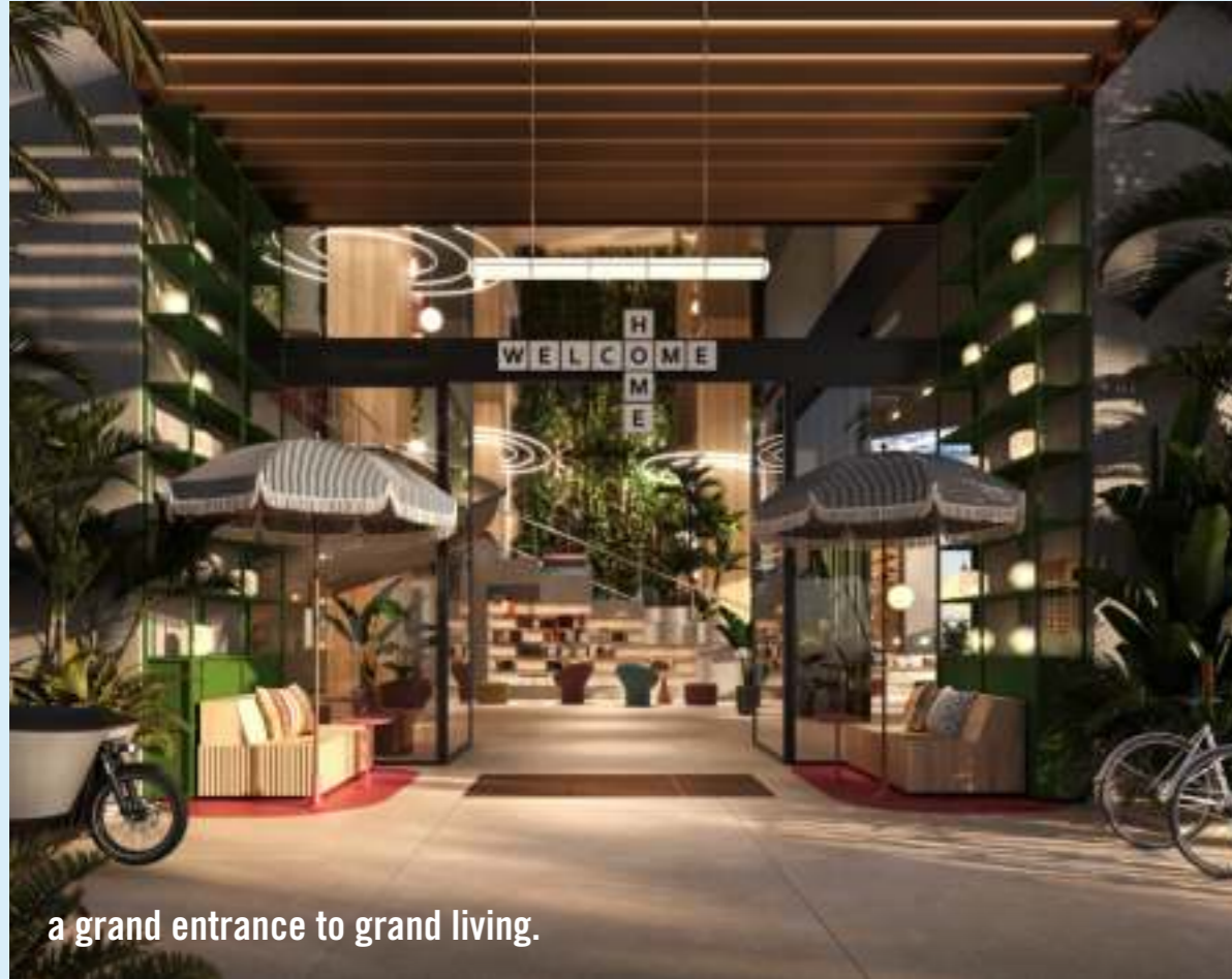
a grand entrance to grand living.