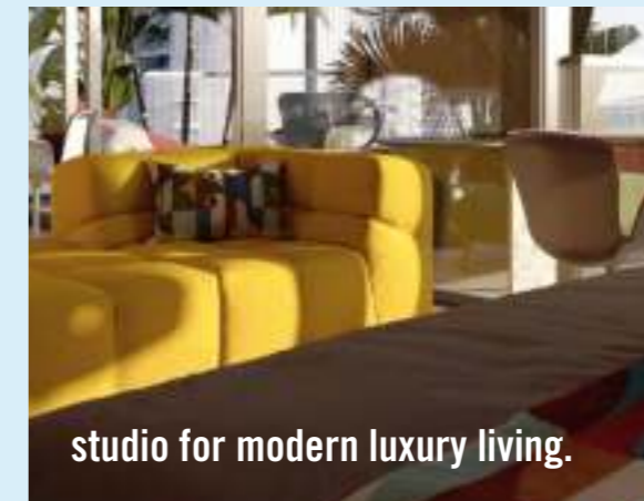
studio for modern luxury living.