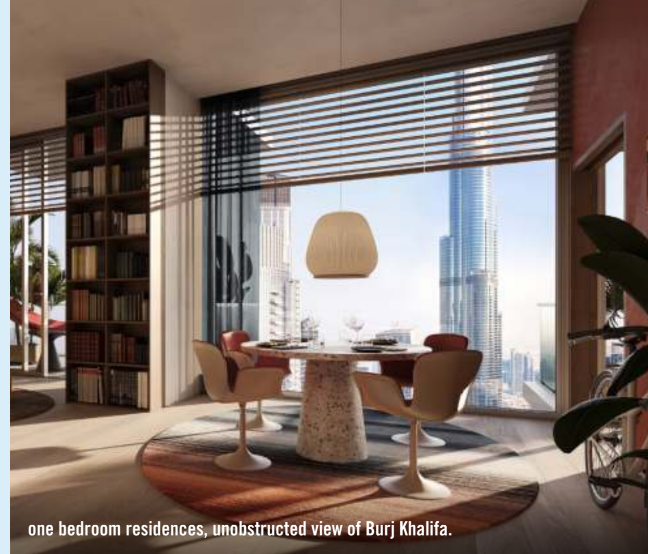
one bedroom residences, unobstructed view of Burj Khalifa.

Ennismore, in a joint venture with Accor, brought its two decades of experience in branded residential projects to life in Dubai with the world's first 25hours residence. This unique residence is inspired and managed by renowned German founded hospitality brand, 25hours.