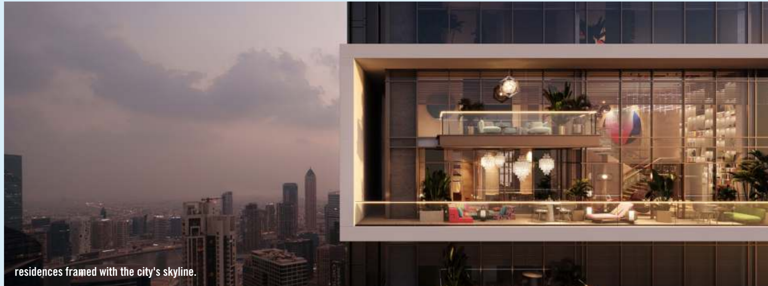
residences framed with the city's skyline.