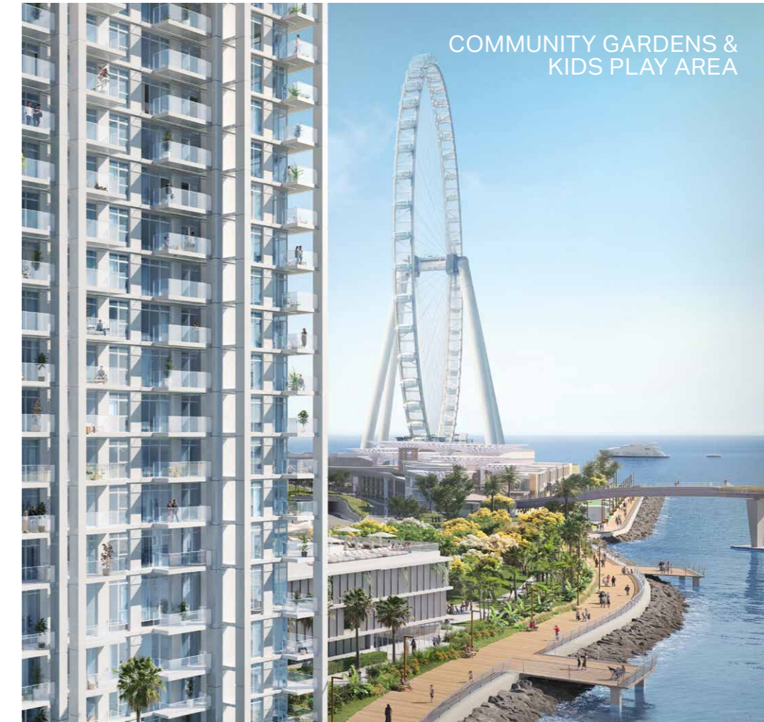
COMMUNITY GARDENS & KIDS PLAY AREA